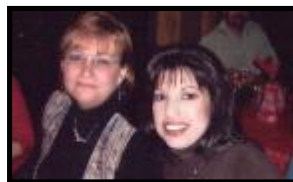
Staff Member of the Year for 2006 and 2007